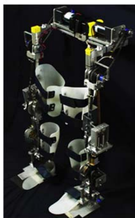
Figure 1: BART LAB LL-EXO1 [1]

The BART LAB LL-EXO is an ongoing project. The 1 st iteration was proposed. The robot was developed for group of patients who cannot control their knee and ankle. The patients have to attaching the BART LAB LL-EXO1 suit with their leg and operate by swung their hip as normal when they want to walk. However the robot has the limitation, a little bit heavy with only walking function [1]. The BART LAB LL-EXO1 is shown in Figure 1.